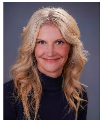
Commissioner Kelley Minty

Pretty incredible, right? What could AI contribute to local government? Imagine making things like getting a building permit or a land use issue resolved even quicker. Klamath County staff are embarking on a task force to start looking for ways to incorporate AI into our processes with hopes of future cost savings. The reality is the technology is here, and while it will not replace people, it can dramatically enhance the productivity of a single individual. Over time, Klamath County will be able to reduce personnel, through attrition, and still provide the same or a greater level of service. At the county, we want to be modern and nimble, and work toward maximizing every tax dollar.